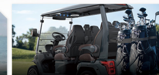
Detachable Dual Bag Holder