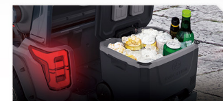
Rear Slide-out Tray with A Wheeled Portable 74-Qt Cooler