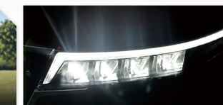
LED Headlights and Taillights