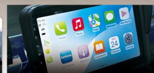
10.1 inch Touchscreen with CarPlay Compatibility