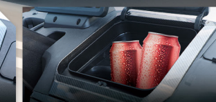
Multifunction Dash with Built-in Refrigerator