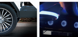
16x7 Aluminum Wheel 225/45R16 Radial Tire