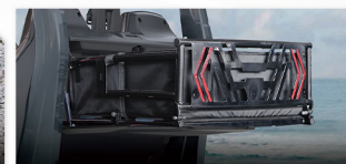
Concealed Foldable Storage Basket & Collapsible Utility Box