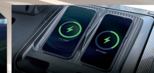
Dual Wireless Mobile Phone Charging