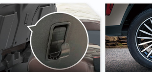
Seat Back Cover Assembly