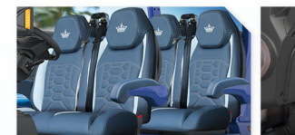
Marine Luxury Seat