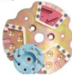
Grinding plate layout 3 pcs 4 inchese wheel or 3pcs grinding shoes