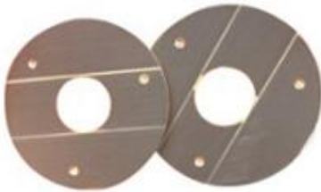
250mm velcro plate for polishing