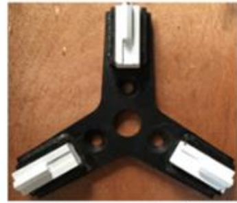
tungsten chipping plate