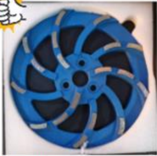
10" Diamond Grinding Wheel