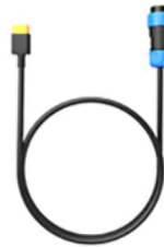
XT-90 Aviation Cable