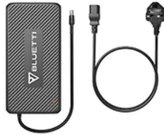
T400 AC Adapter & Cable