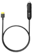
Car Charging Cable (XT90)