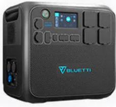
AC200Max power Station