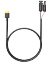
PV Charging Cable (XT90-MC4)