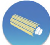
Golden Fin *

Note: All features and specifications are subject to change without prior notice for product improvement purposes. (* means optional)