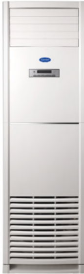
IDU for 55K BTU/HR