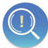
Self-diagnosis and Auto-protection