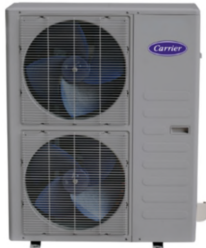
CDU for 55K BTU/HR

GA Series are suitable for most different space and show in good taste.