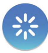
Auto Restart Function