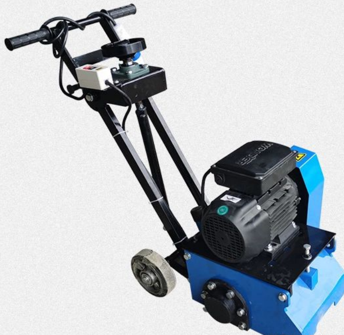
SELF PROPELLED CONCRETE SCARIFIER