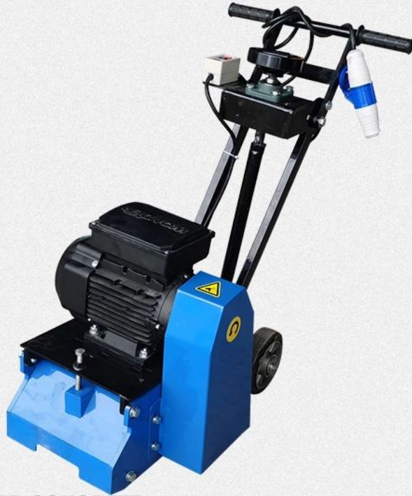
SELF PROPELLED CONCRETE SCARIFIER