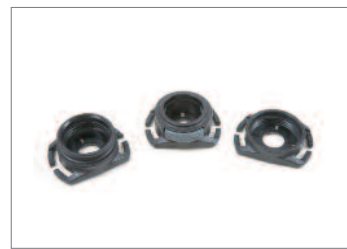
Dräger LDV holder