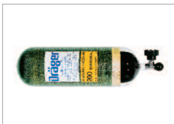
Dräger Cylinder range