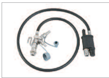
Automatic switch over valve for use with an airline unit