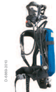
Dräger PSS® 3000

Today's first responders demand reliability and consistency from their breathing apparatus whatever the environmental conditions. Resulting from years of research and extensive user consultation, the Dräger PSS 3000 has been developed to meet these fundamental needs: