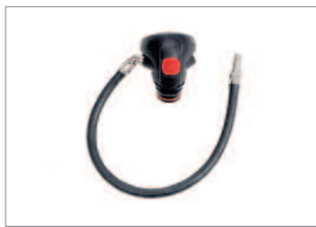
Dräger Plus LDV range