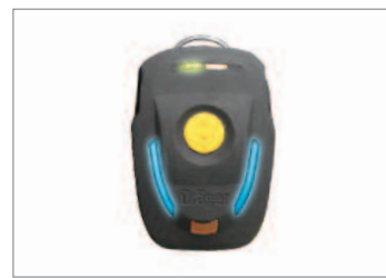
Dräger Bodyguard® 1000