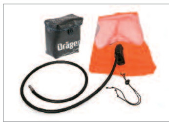
Dräger PSS® Rescue hood