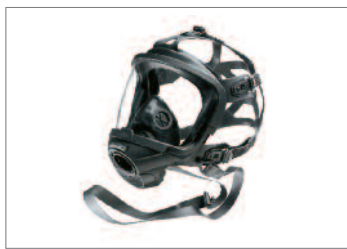
Dräger FPS® 7000 full face mask range