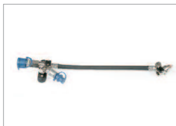
Second medium pressure combined connector