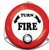
Manual Rotate Bell