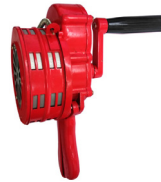
Hand Crank Siren