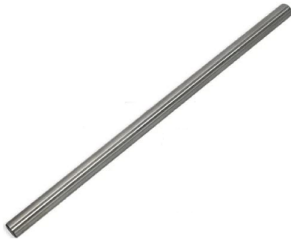
Milling Cutter Shaft