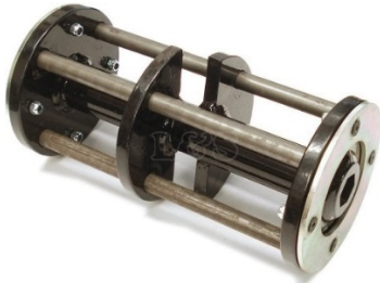
Drum Set Assy (Not include Cutter Blade)