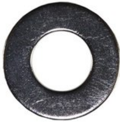
Flat washer for cutter blade