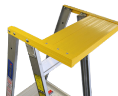
PROPHDTS Heavy Duty Top Shelf