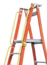
PROPSHR Side Hand Rails