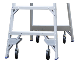
PROPWK Spring Loaded Wheel Kit