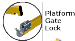
Platform Gate Lock