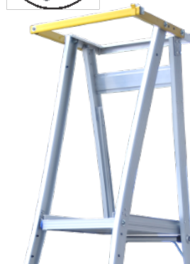
PROPG Rear Safety Gate