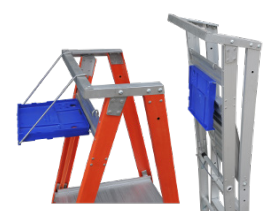
PROPTT Tool Tray